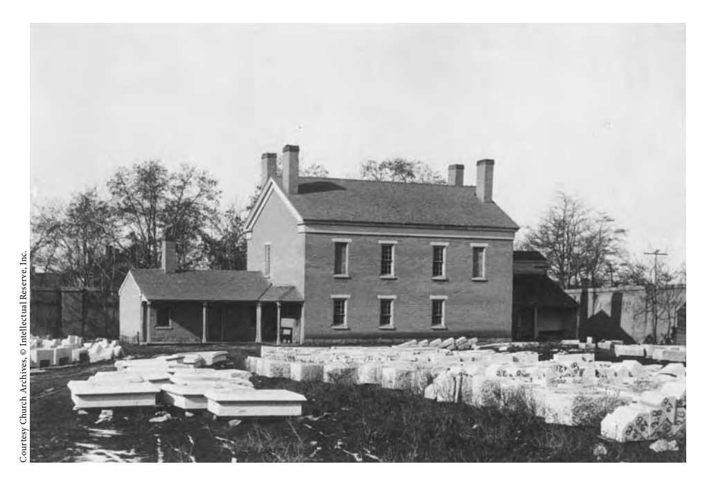
Fig. 2. Endowment House, Temple Square, ca. 1885, photographed by F. I. Monson and Company. Endowments for the living were performed here for thirty-four years. The cut and numbered stones in the foreground are for building the Salt Lake Temple.

there and assisted in baptizing and confirming over 500. Never felt better in my life . . . and tho I had to travel 350 miles to attend to it, and 350 back again, I do not think it too much. 59