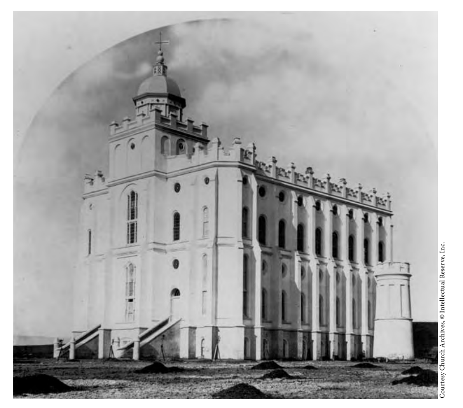
FIG. 1. St. George Temple, ca. 1877. The first endowments for the dead were performed in the St. George Temple. This view shows the temple as it was originally constructed, with a shorter spire than present. The spire was struck by lightning in 1878 and rebuilt with a higher, more majestic design.